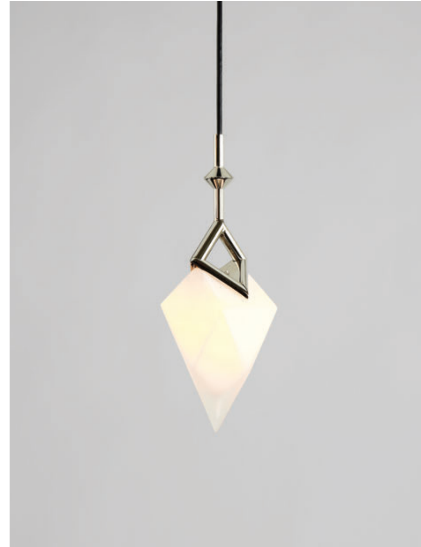
Single Pendant (Polished Nickel / White) Dia 4 in / 10 cm × H 5.5 in / 14 cm