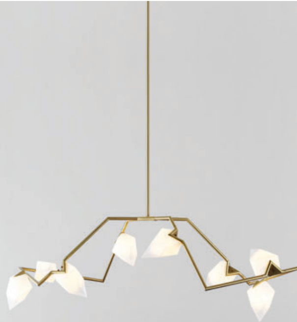
04 (Brushed Brass / White) L 61 in / 154 cm × W 25 in / 64 cm × H 19 in / 48 cm