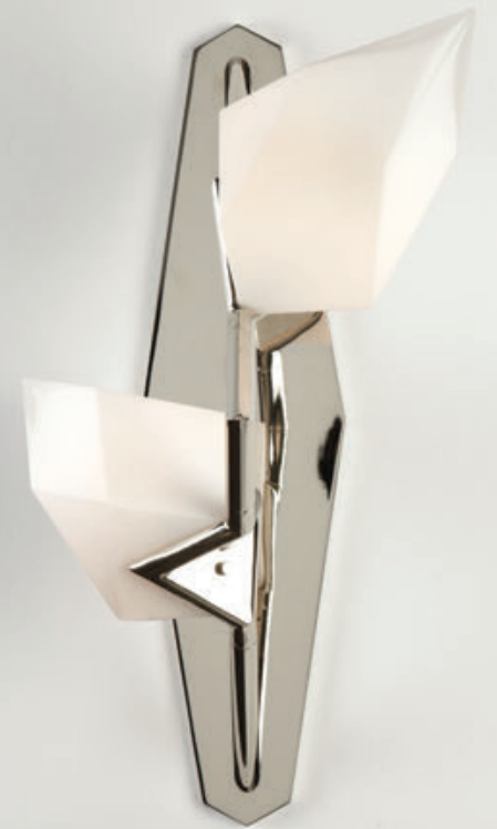
Sconce (Polished Nickel / White) H 19 in / 48 cm × W 9.5 in / 24 cm × D 11.5 in / 29 cm