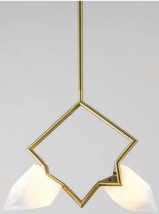
Double Pendant (Brushed Brass / White) L 15 in / 38 cm × W 12 in / 30 cm × H 14 in / 36 cm