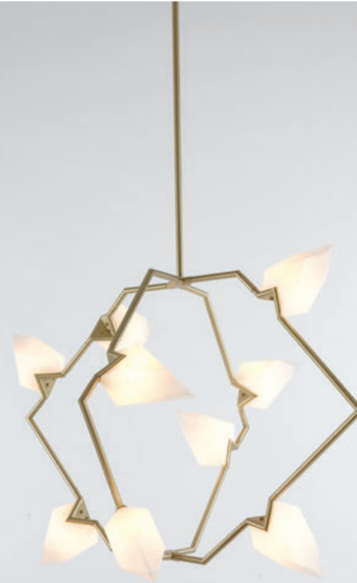
01 (Brushed Brass / White) L 25 in / 63.5 cm × W 33.5 in / 85 cm × D 32 in / 81 cm