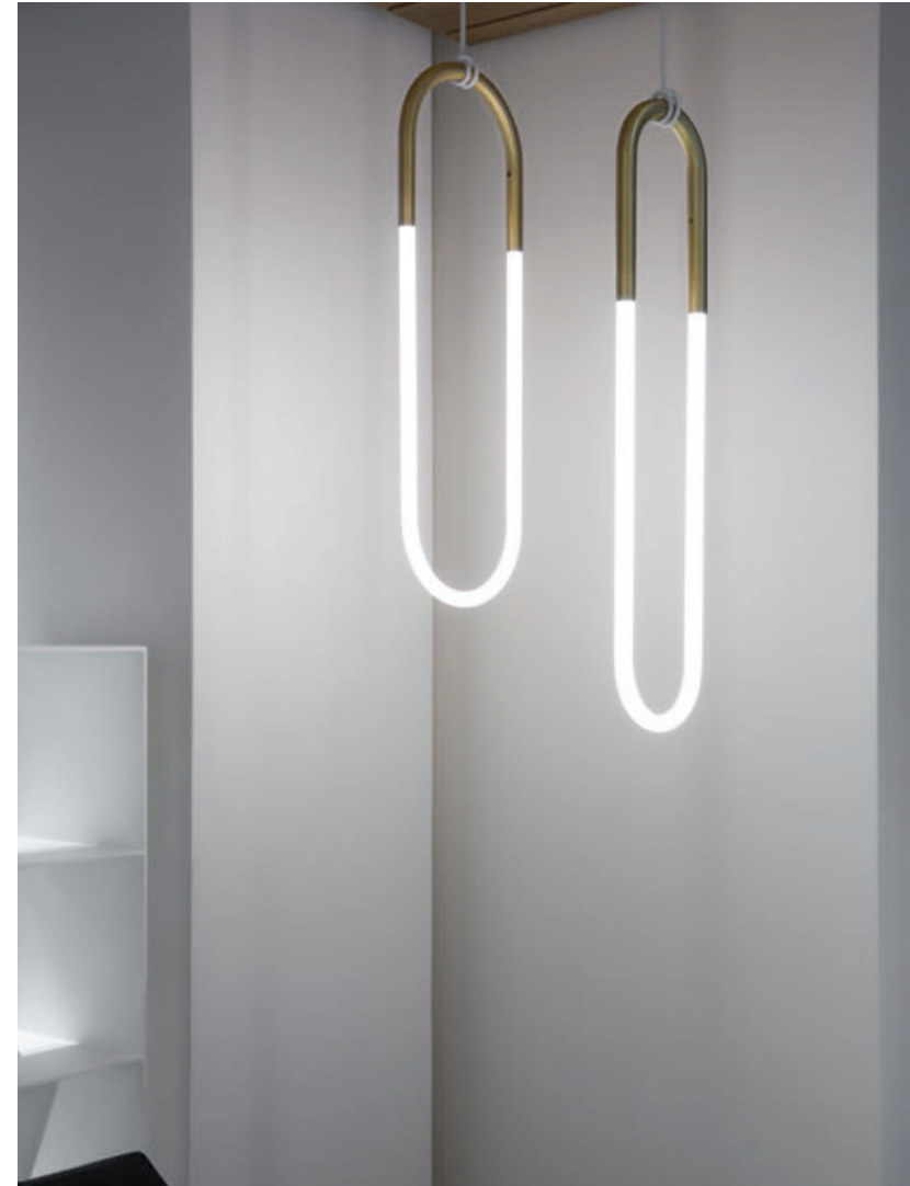
Loop 02 (Satin Brass) L 1 in / 3 cm × W 11 in / 28 cm × H 36 in / 92 cm