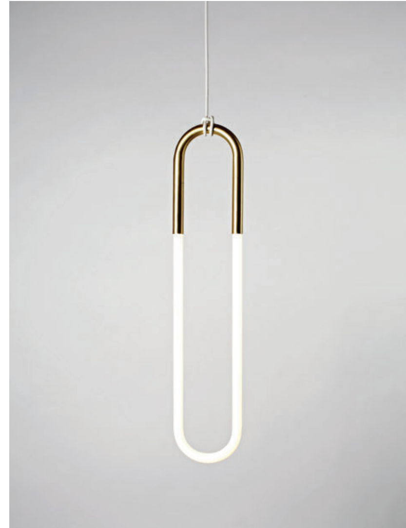
Loop 01 (Satin Brass)

L 1 in / 3 cm × W 7 in / 18 cm × H 35 in / 88 cm