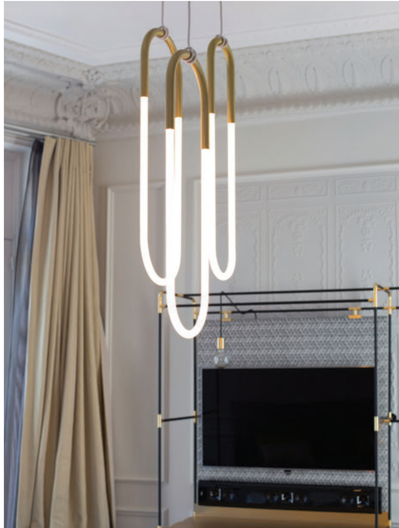
Loop 01 (Satin Brass)

L 1 in / 3 cm × W 7 in / 18 cm × H 35 in / 88 cm