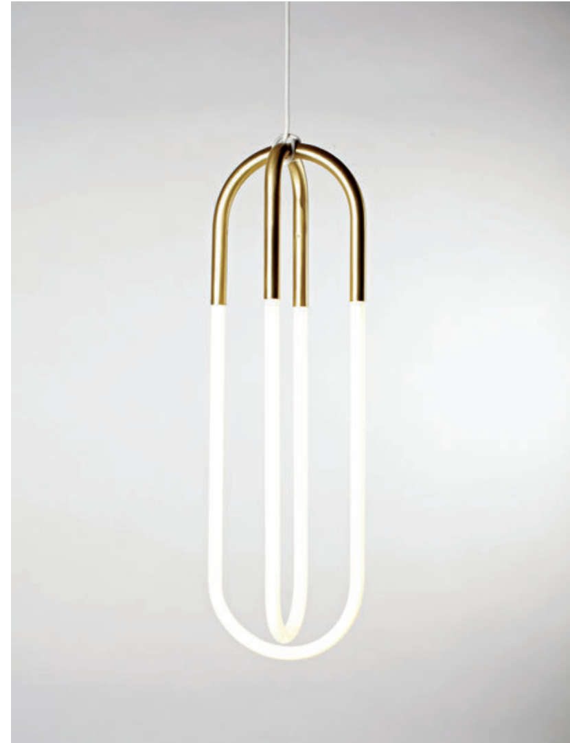
Double Loop (Satin Brass)

L 1 in / 3 cm × W 11 in / 28 cm × H 36 in / 92 cm