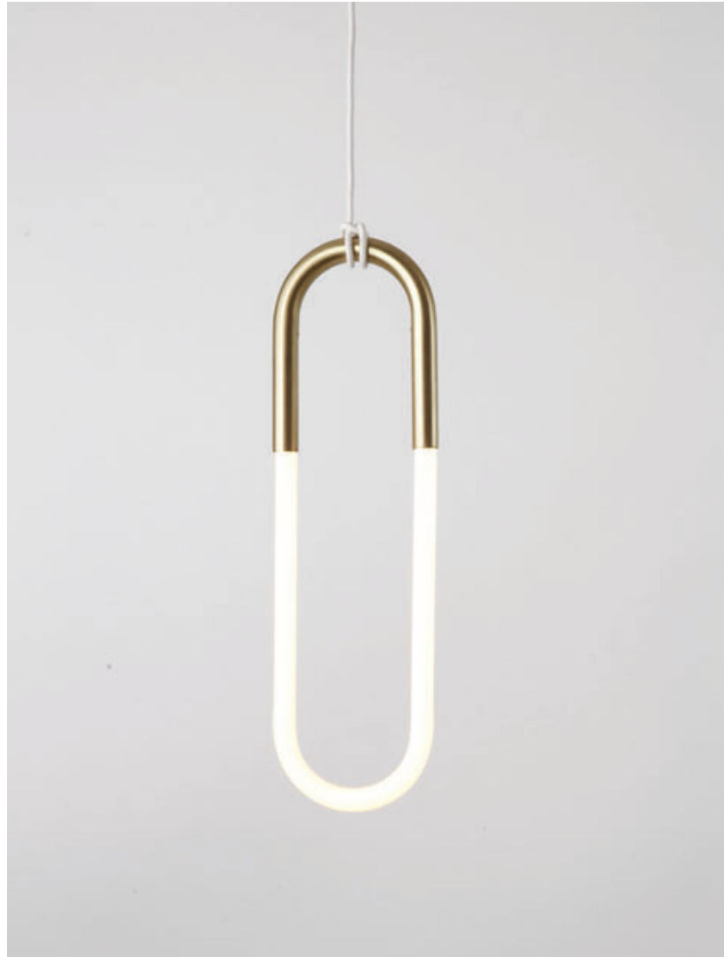
Loop 03 (Satin Brass) L 1 in / 3 cm × W 7 in / 18 cm × H 26 in / 67 cm