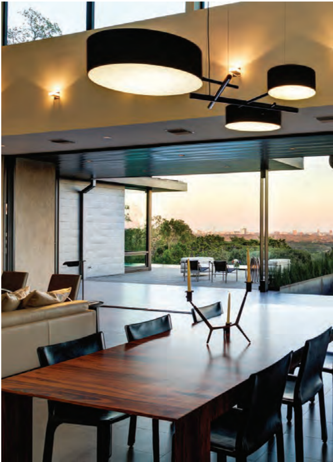
Private residence, Austin