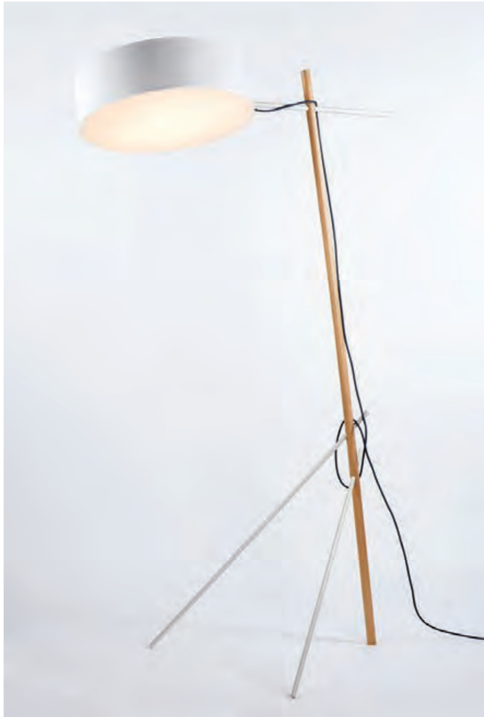
Floor Lamp (White/Oak)

H 86in/218cm x W 34.5in/88cm x D 51in/130cm