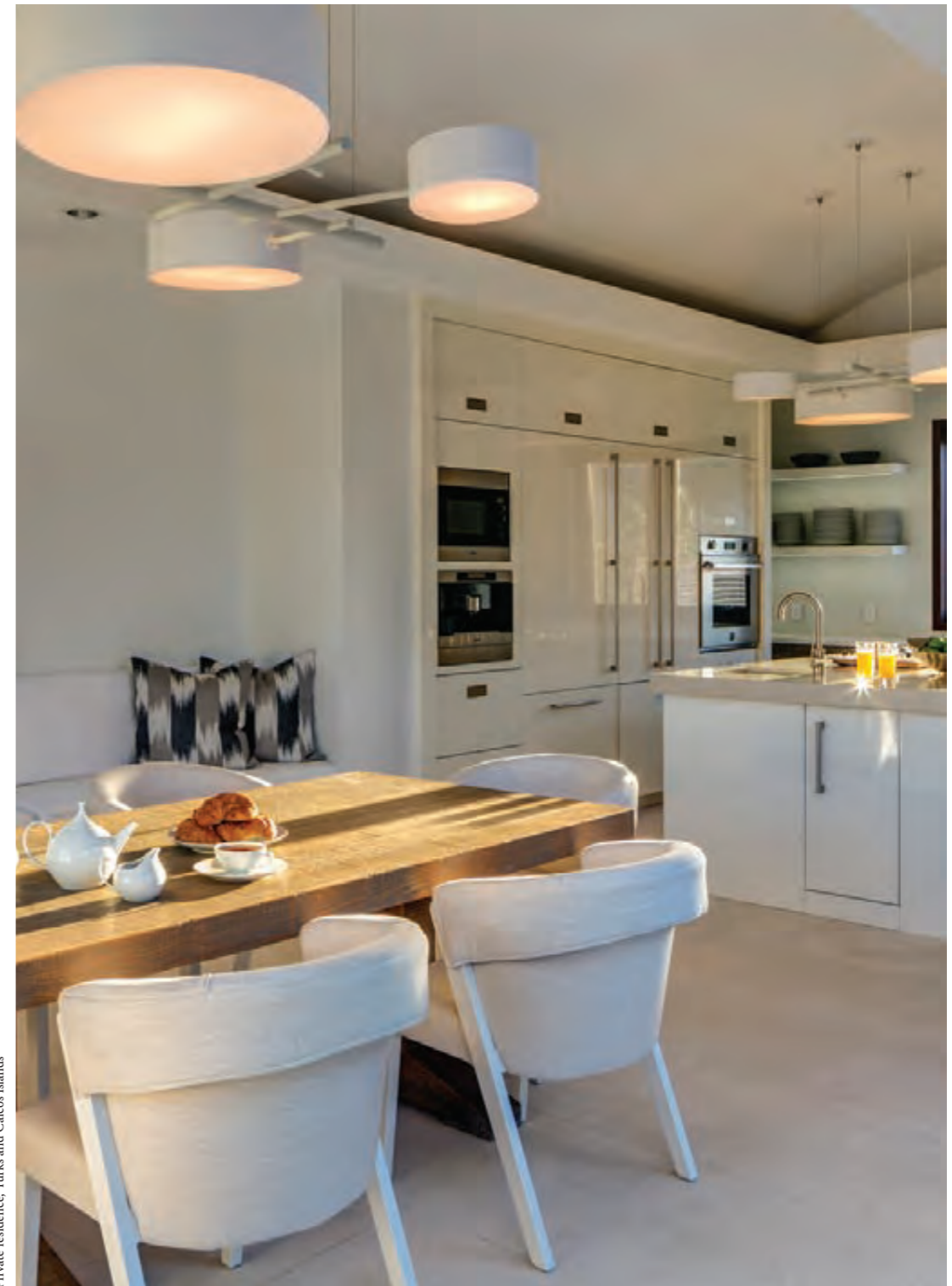
Private residence, Turks and Caicos Islands

has a different point of view; one explicitly loves materiality, another has an unconventional color palette and eye for sculptural form, the third is an inventor bringing spontaneity and theatrical energy to the work.