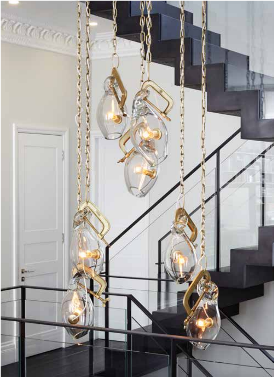
CL.01.01, Clamp Light installation