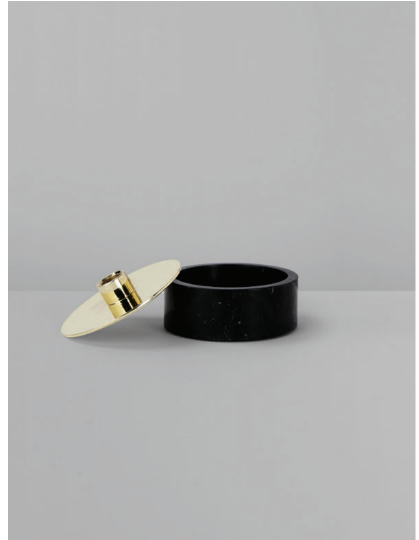
(Black Marble / Polished Brass) H 3 in / 7 cm × W 4.5 in / 12 cm × D 4.5 in / 12 cm