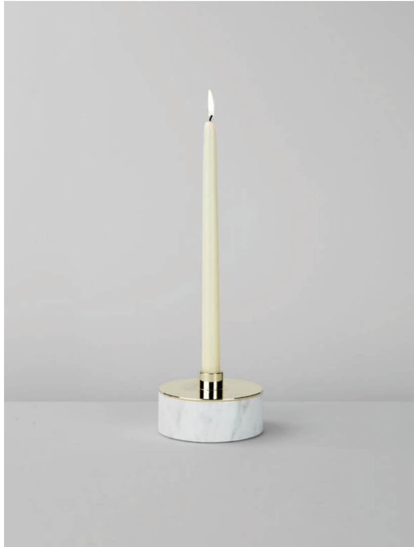
(White Marble / Polished Brass) H 3 in / 7 cm × W 4.5 in / 12 cm × D 4.5 in / 12 cm