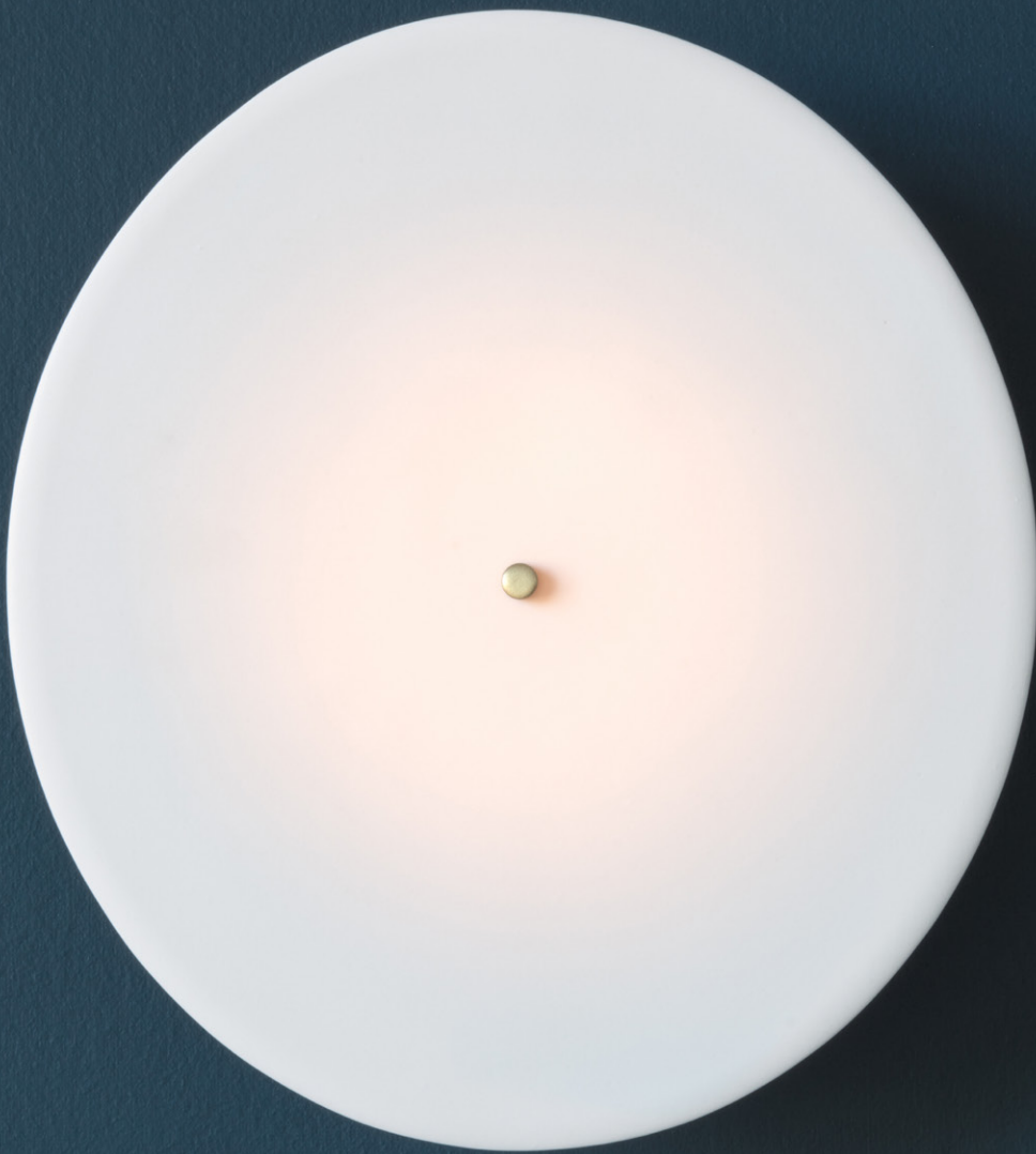
Brushed Brass Porcelain Disc