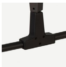
Oil Rubbed Bronze