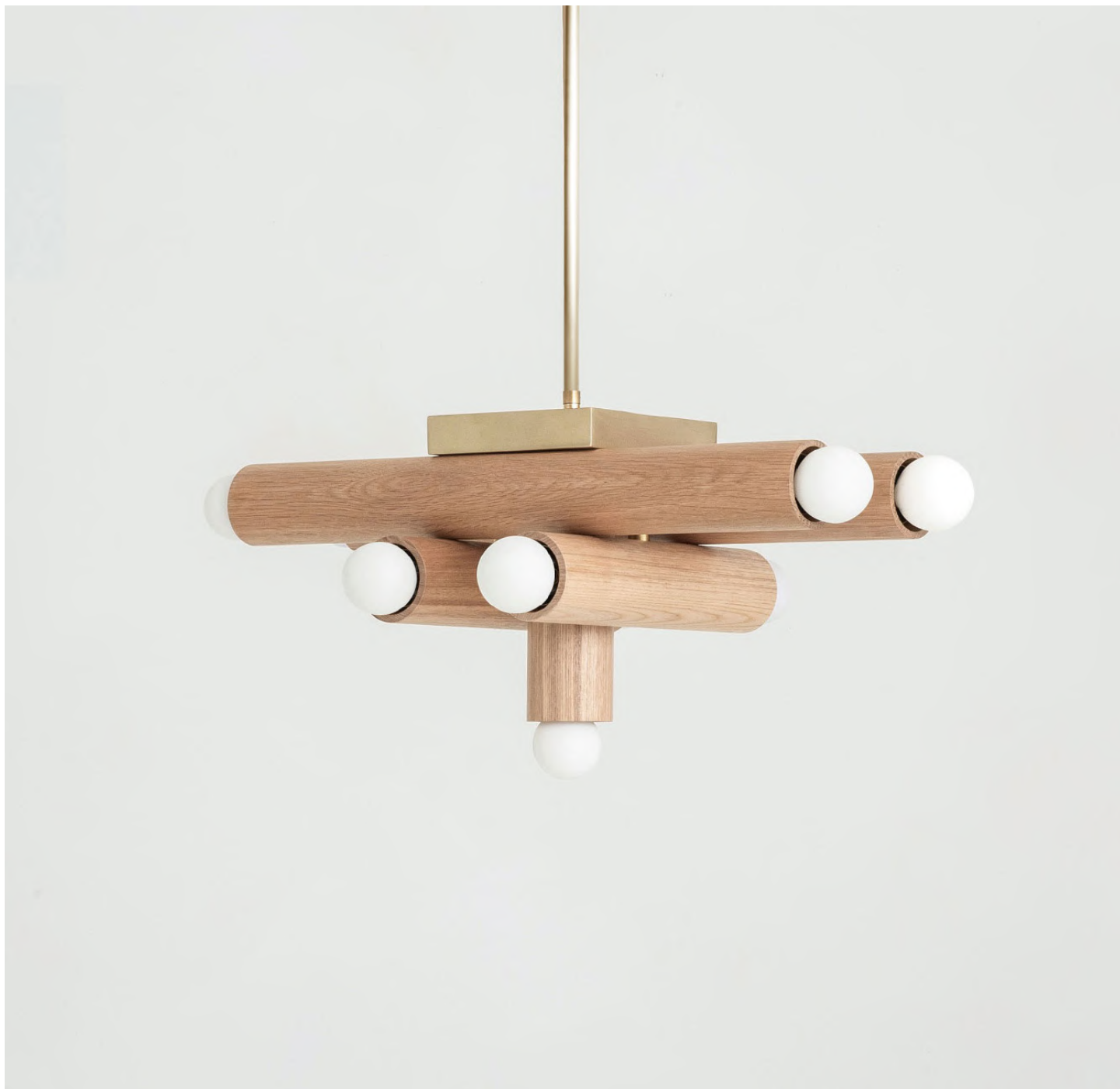
HIEROGLYPH PENDANT natural oak