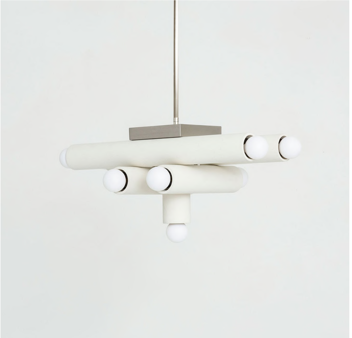
HIEROGLYPH PENDANT painted white