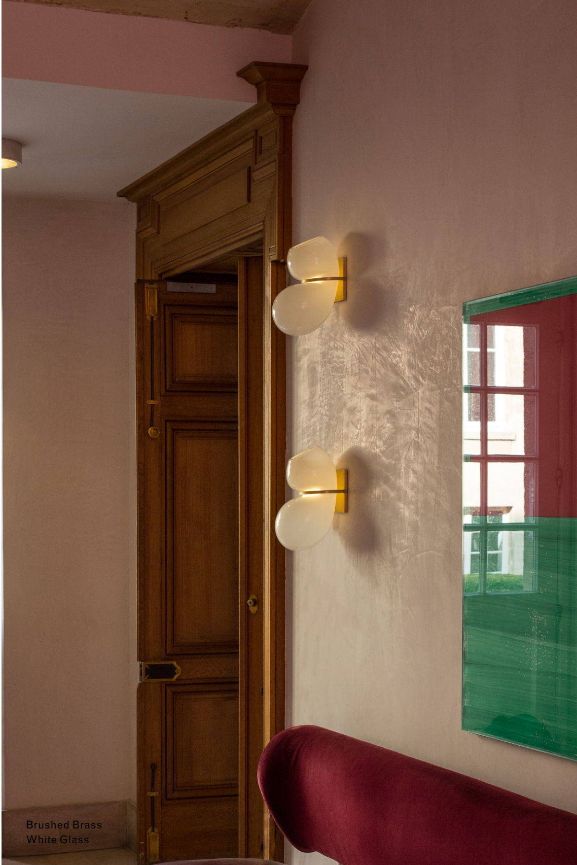
Brushed Brass White Glass