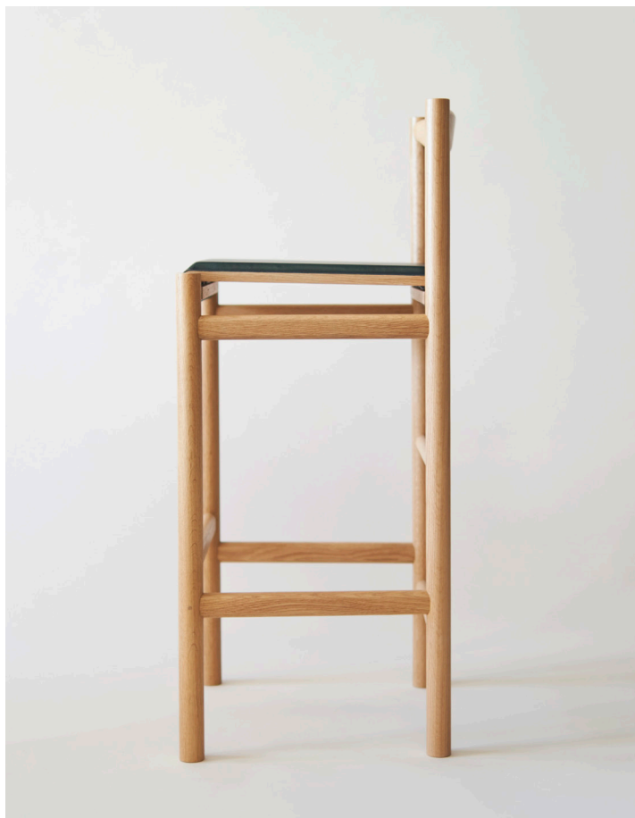
*Bar height shown

A shaker inspired design with mortise and tenon joinery creates a solid lightweight frame with a contoured backrest. Upholstered seat cushion is removable for cleaning, repair or replacement. Available without cushion as well