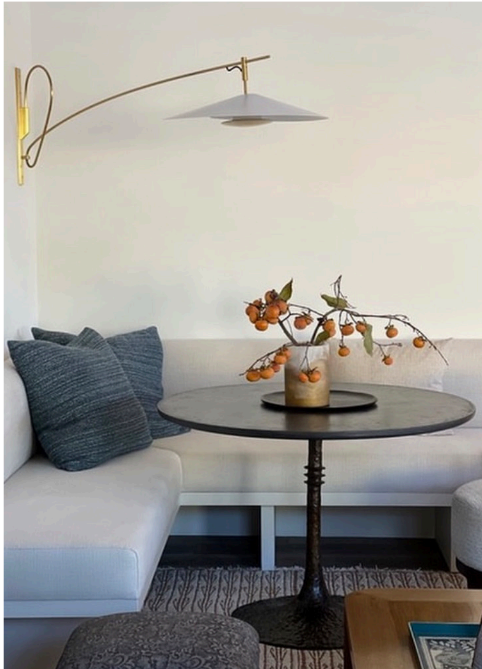
218 Treble Sconce White Satin + Brushed Brass