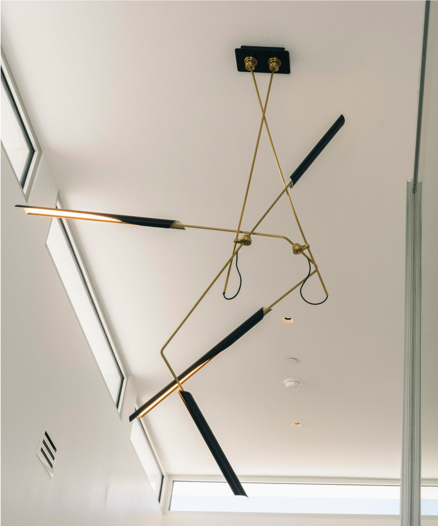
Custom 447 OTTO V + 446 OTTO L Pendant Black Satin + Brushed Brass