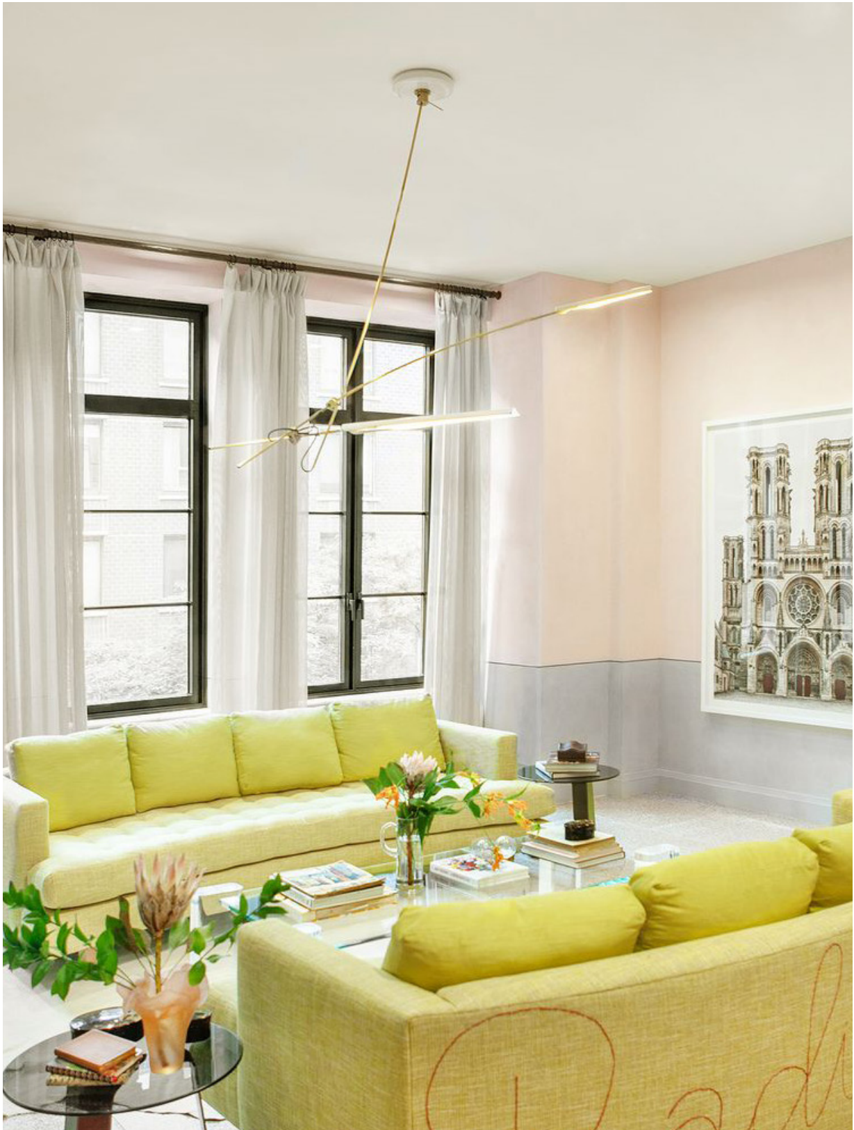
444 OTTO Two Arm Pendant White Satin + Brushed Brass