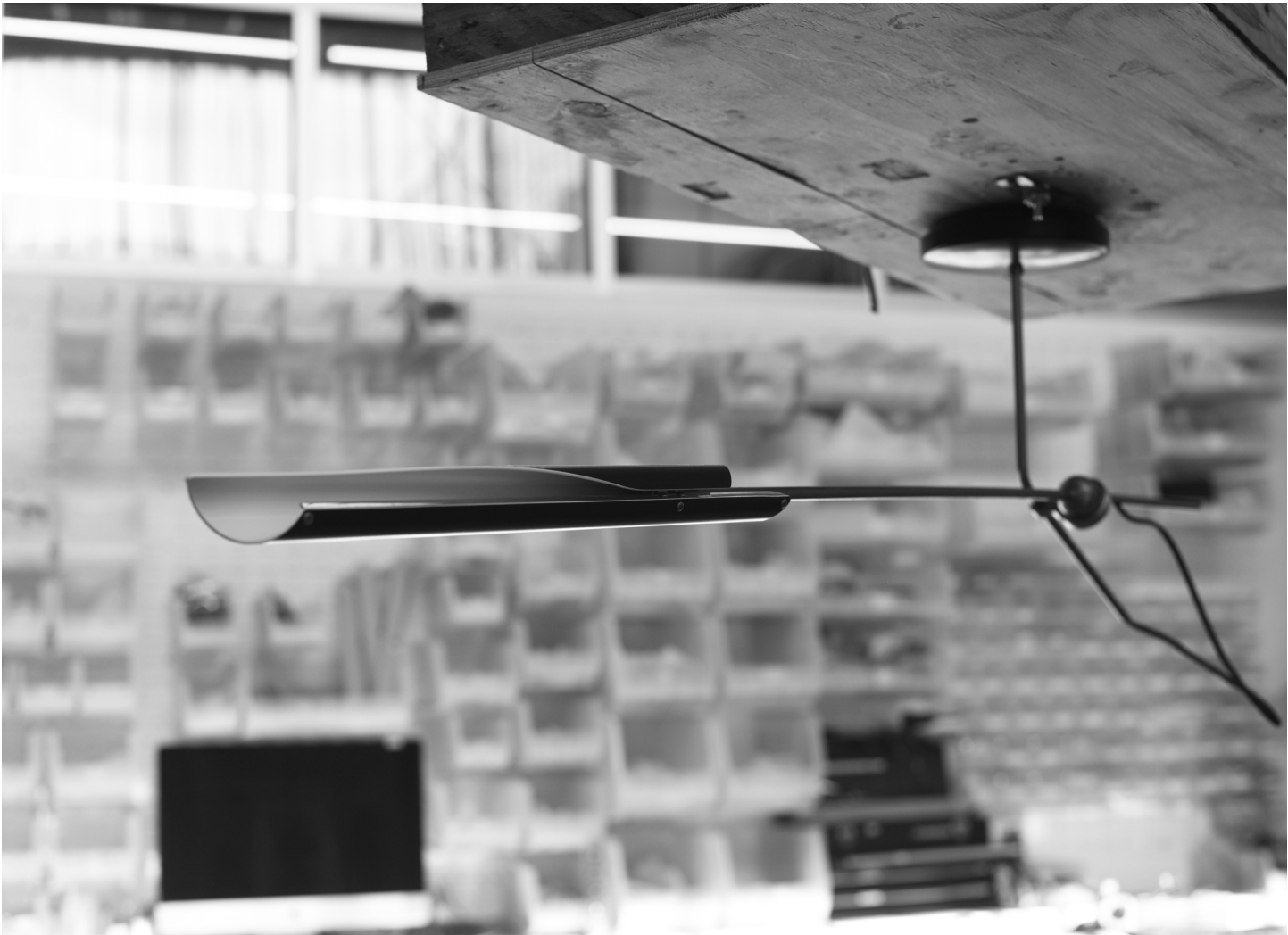
438 OTTO Loop Pendant Black Satin + Brushed Brass