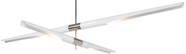
Shown above with 2 tiers

The Hennen Cross is a fixture comprised of two or more tiers on a central axis. Tiers are configured with large or small shades that can be set to cast light up or down. Tiers scissor open and are adjustable on site