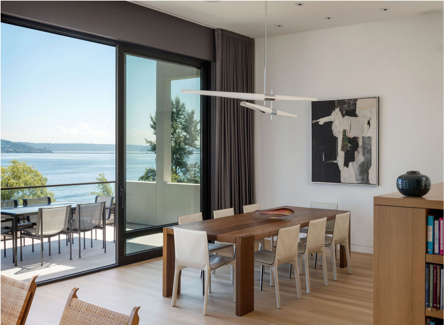
430 Hennen Mobile White Gloss + Polished Nickel