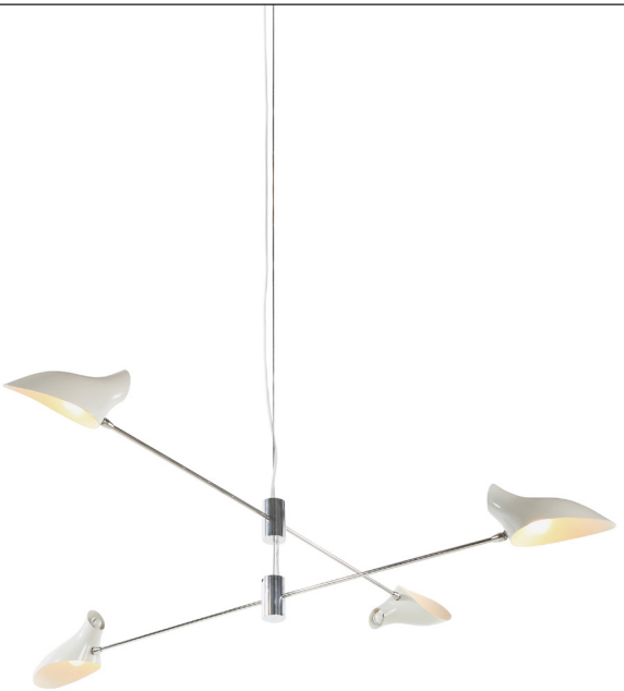
Shown above with two tiers

The Bottle Tiered Pendant features a plated frame and hand spun Bottle shades that rotate 320° to cast light directionally. Customizable with longer or shorter tiers. Additional tiers can be added.