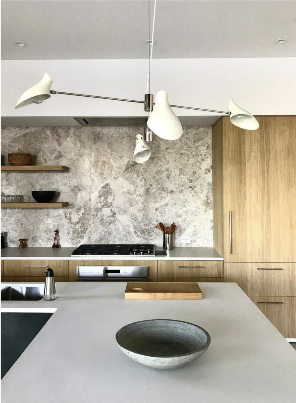
407 Bottle Tiered Pendant White Satin + Polished Nickel