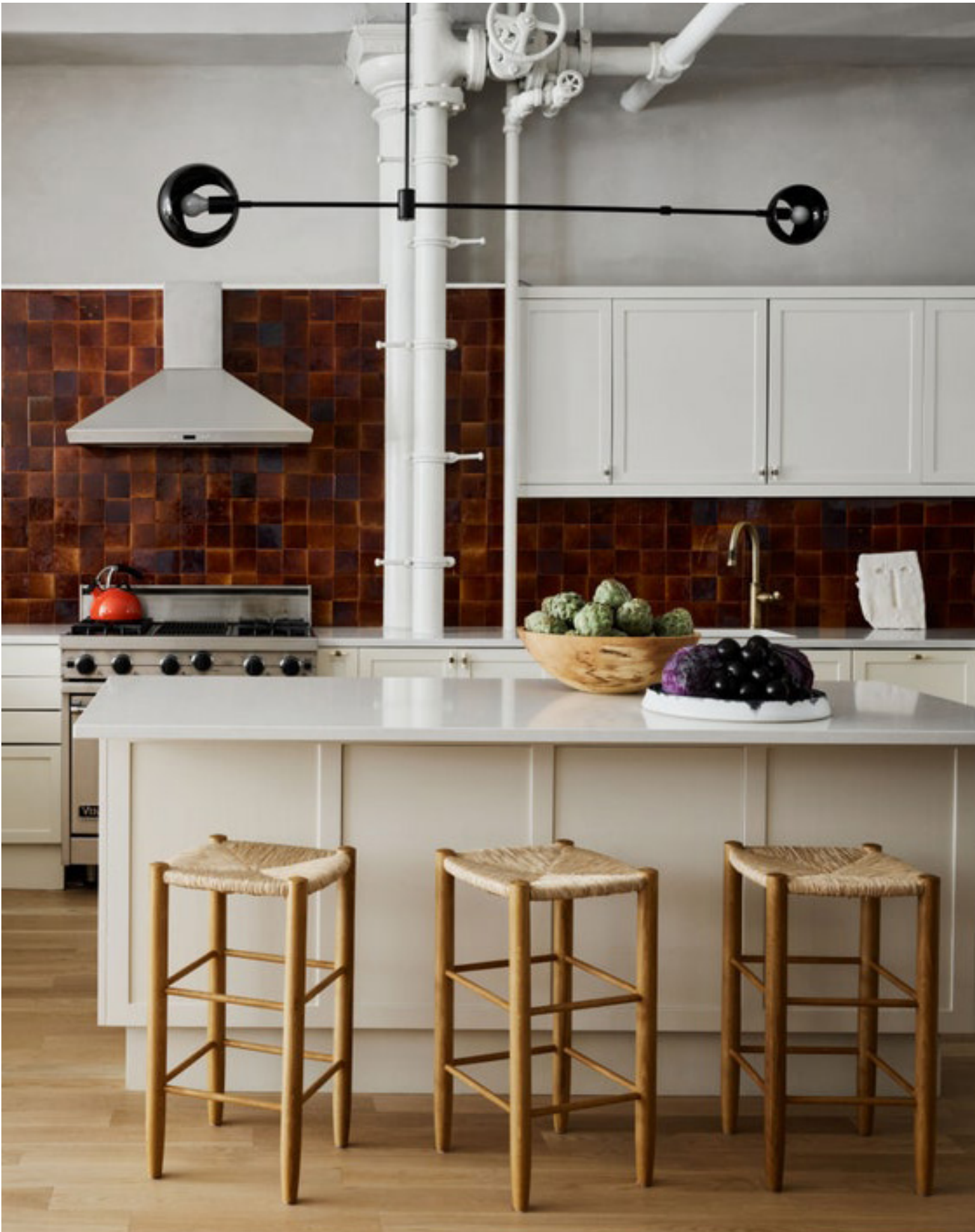
435 Boi Pendant Duo Black Gloss