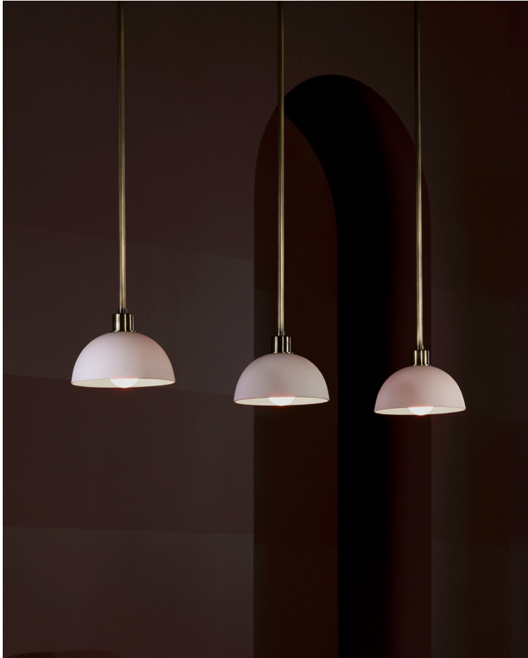
AGED BRASS / PORCELAIN