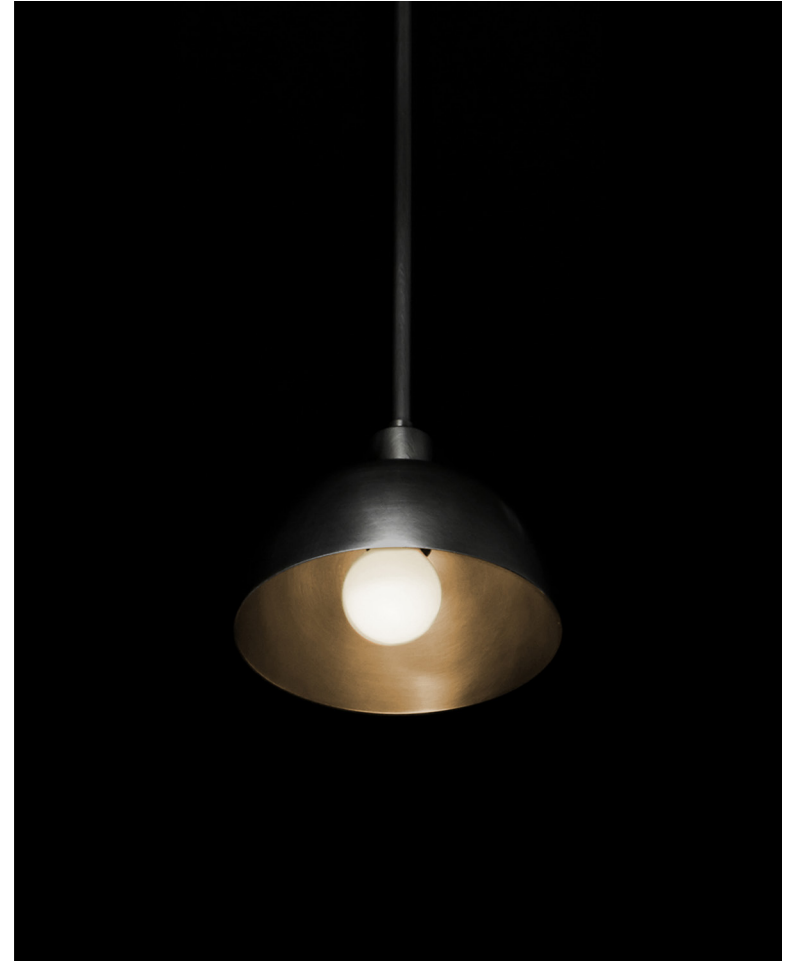
AGED BRASS / TARNISHED SILVER