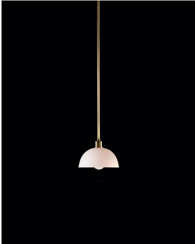
AGED BRASS / PORCELAIN