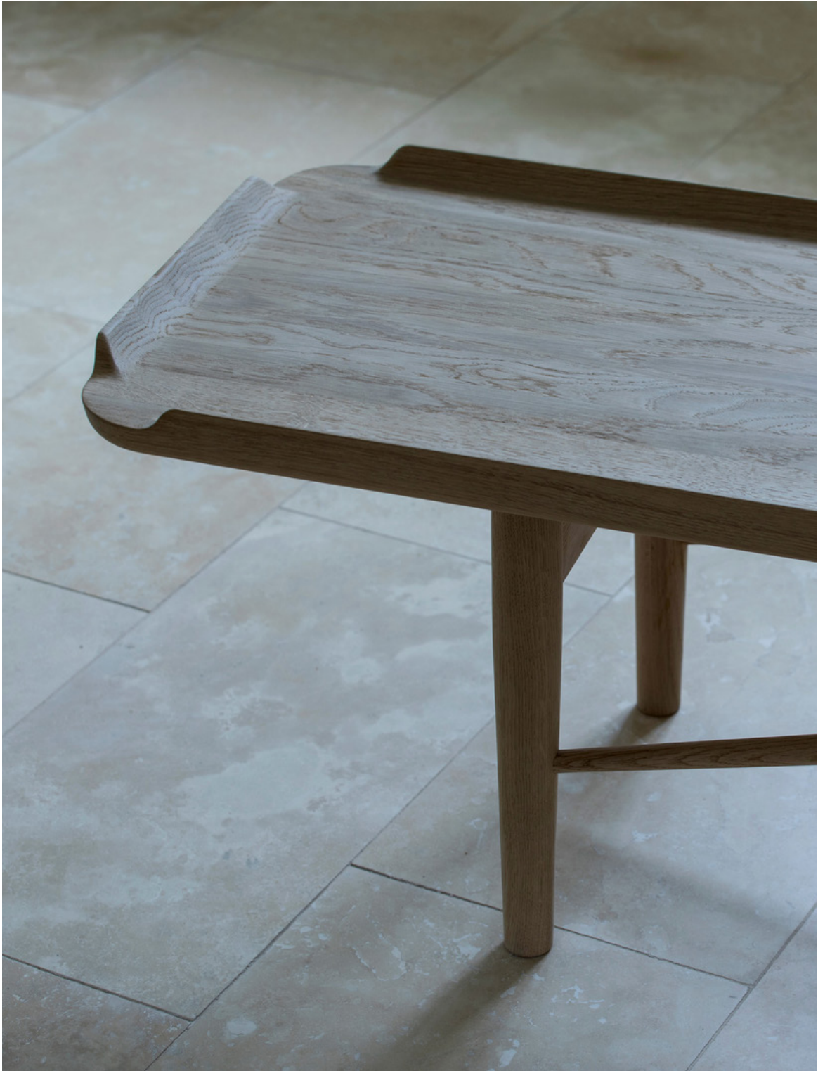
COCKTAIL BENCH 1951 BY FINN JUHL