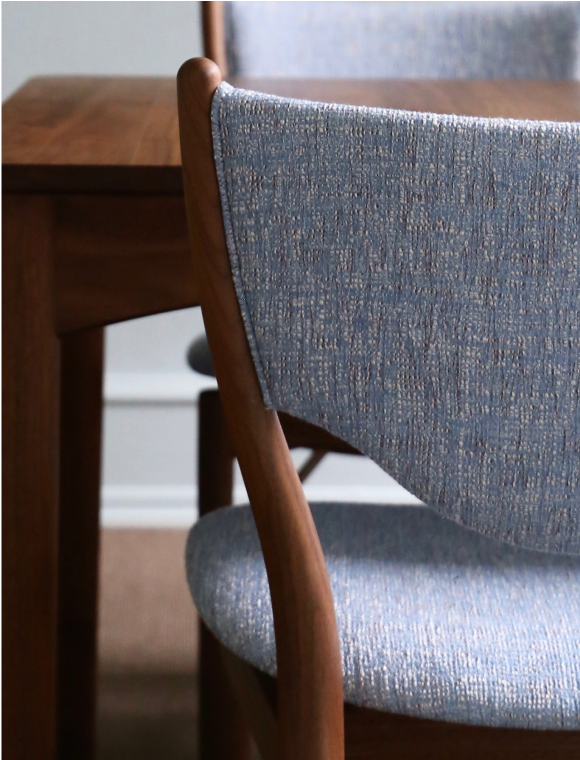
46 CHAIR 1946 BY FINN JUHL