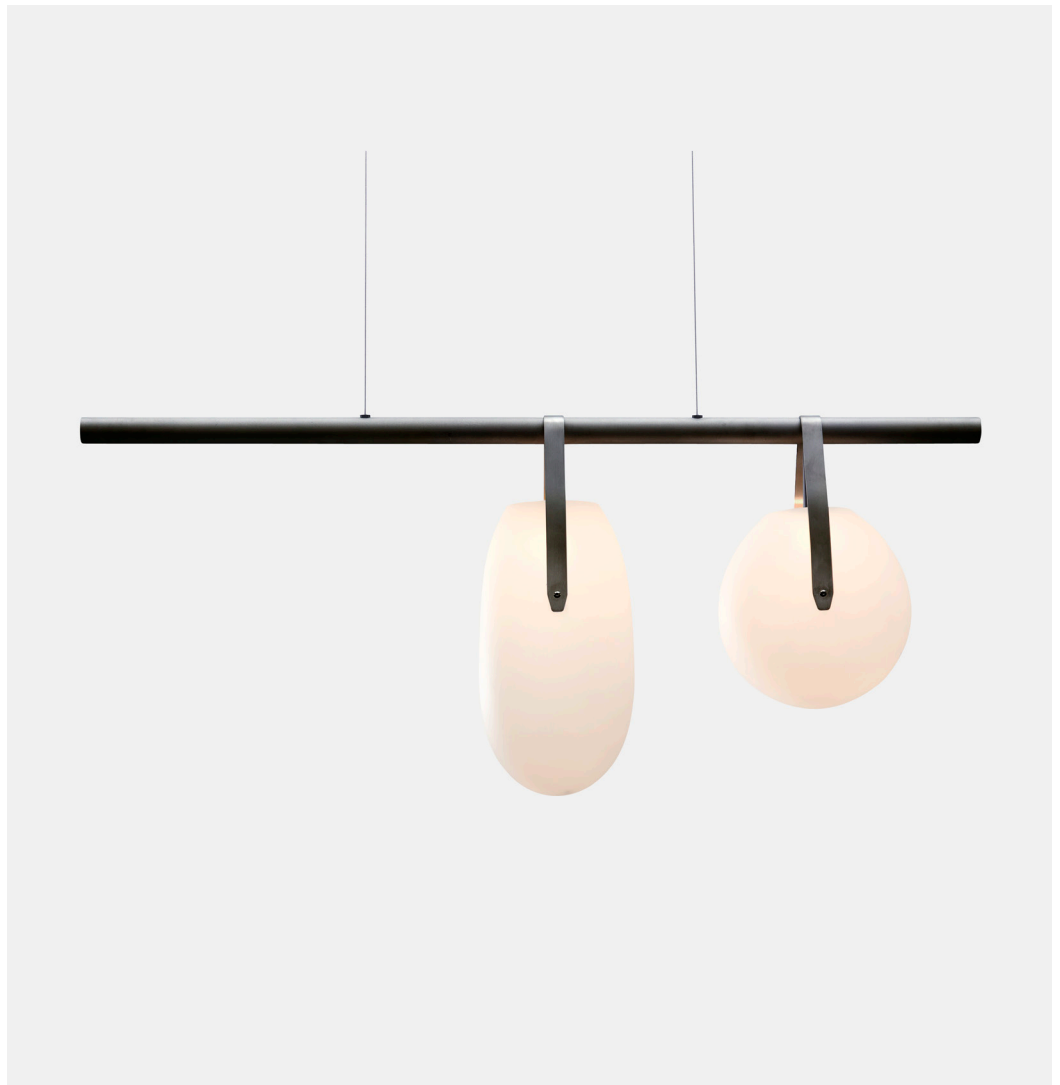
Shown: GC-4220 (2 Sym. Large Globes)

37 W 20th Street Suite 707 New York NY 10011 T +1 212 388 1621 sales@richbrilliantwilling.com